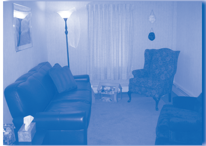
Our beautiful new office in Windsor, NY.